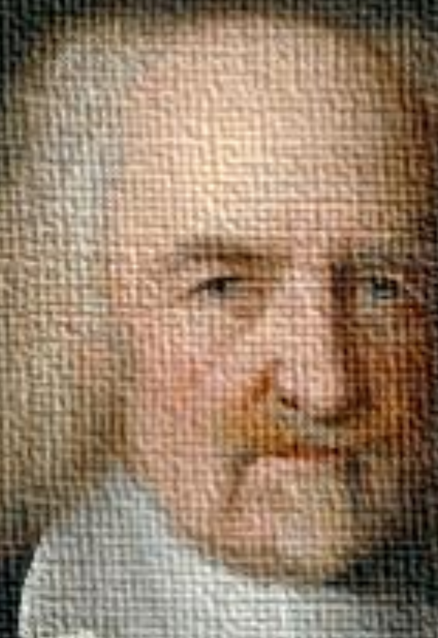
Thomas Hobbes (1651)