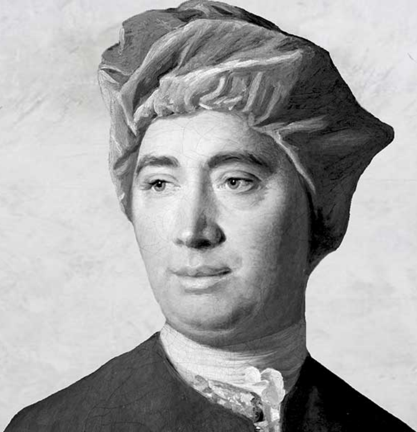
David Hume Scottish philosopher 1711-1776