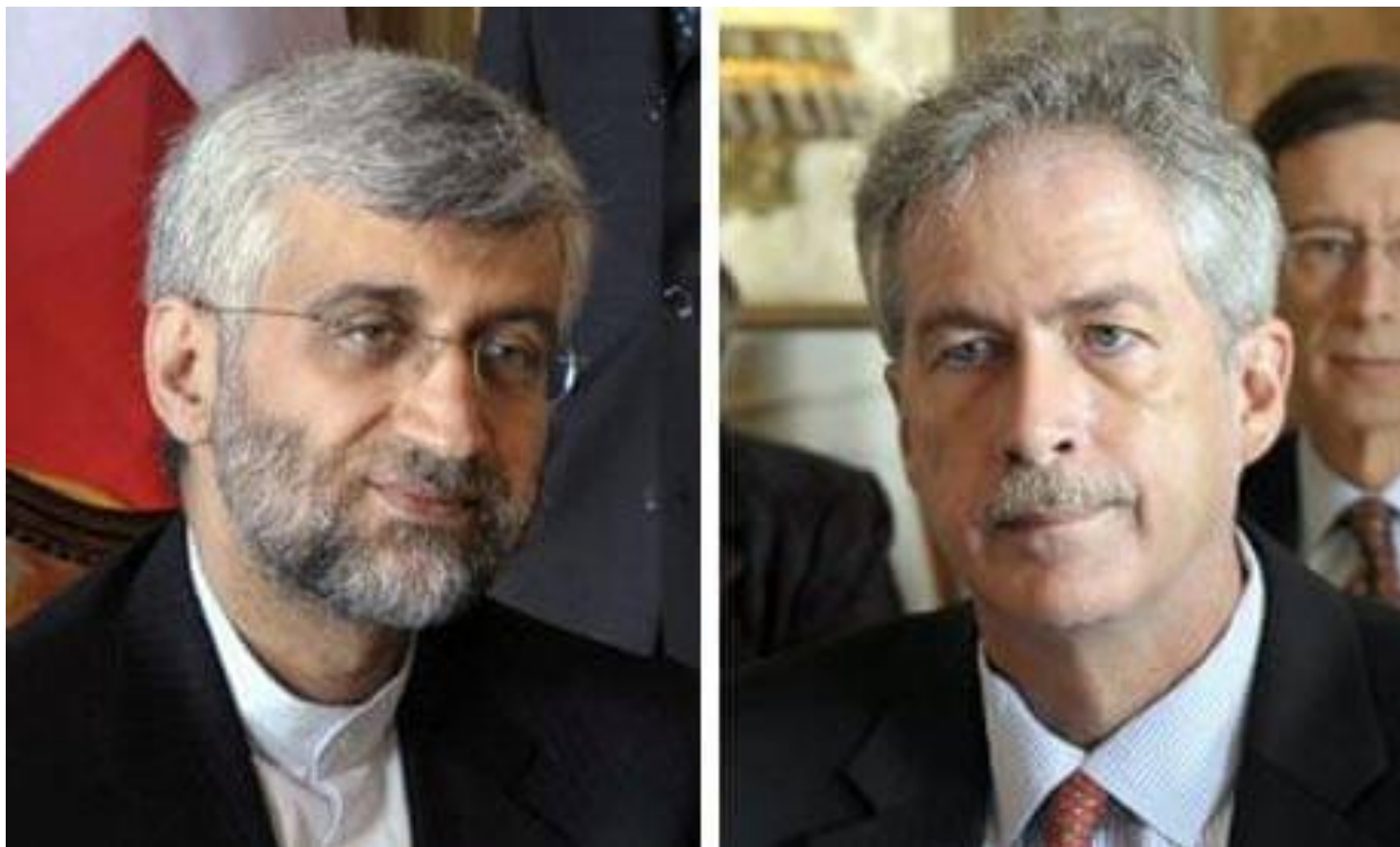
Geneva, October 2009