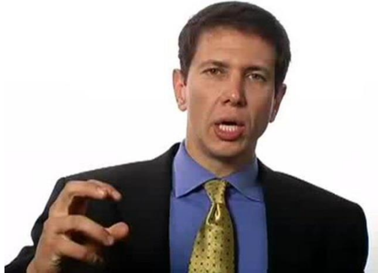
Ronen Bergman NY Times